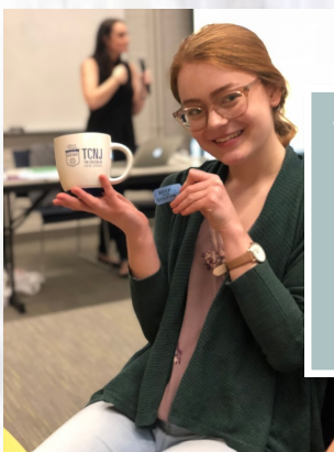
TCNJ student at the 2018 Alumni Psychology Trivia event

Students will learn to apply basic social science principles and theories to an understanding of the behavior of consumers. Basic psychological principles (e.g., learning, memory, perception, attitudes, and motivation), as well as sociological and anthropological concepts (e.g., demographics, group dynamics, cultural influences), are explored and examined in relation to consumption processes and activities used by marketers and public policy actors to influence consumer behavior.