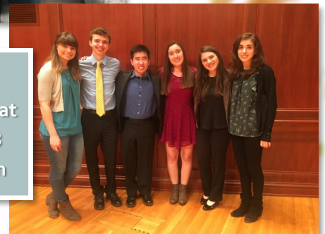
Psi Chi members at the 2018 Induction