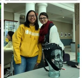
TCNJ psychology students demonstrating #hienergy and #hiachieving attitudes ( Instagram, 4/22/19 )