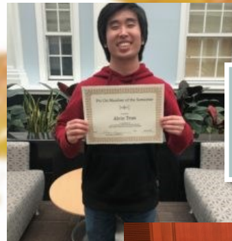
Psi Chi Member of the Semester Award : Spring 2019

EMAIL PSICHI@TCNJ.EDU FOR MORE INFORMATION